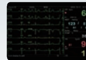
7 ECG leads simultaneous display