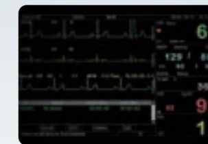
Short trend & waveform display