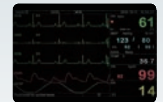
3 channel ECG amplification